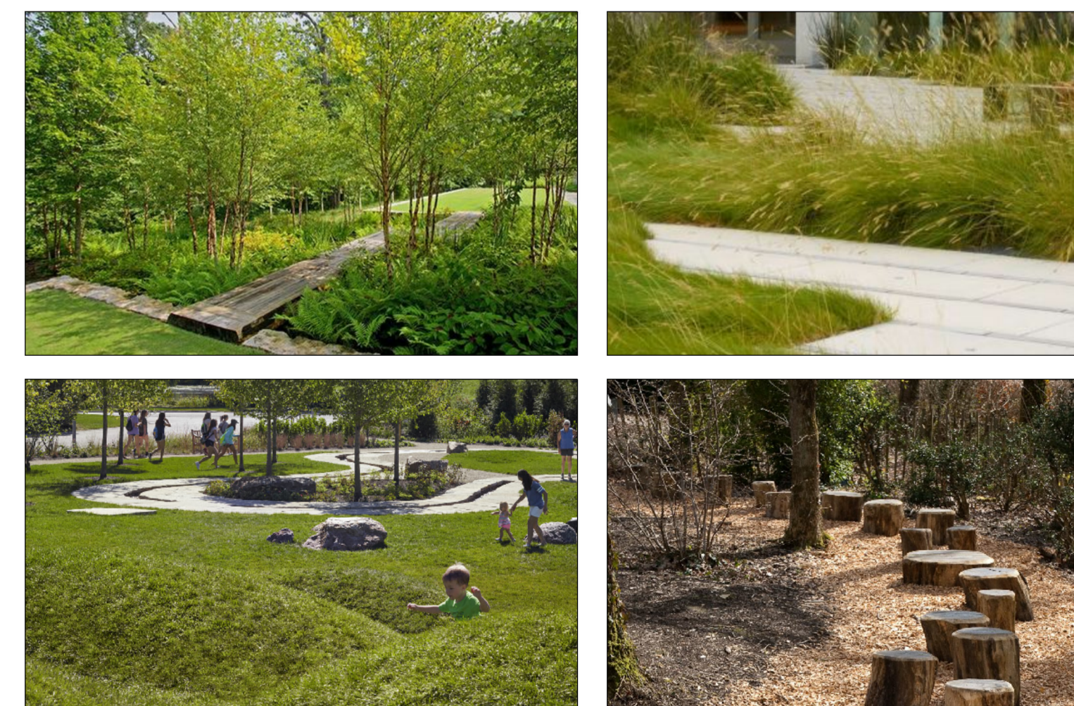
BOYNE VIEW GARDENS, INDICATIVE IMAGES

NOTE: - DRAWING ISSUED FOR PLANNING PURPOSE ONLY. LANDSCAPE IS SUBJECT TO APPROVAL OF THE PLANNING AUTHORITY